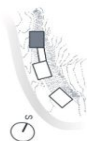
Schéma půdorysu bytu představuje dispozici řešení bytu. Kuchyňská linka a nábytek nejsou součástí dodávky bytu, zařízení je zobrazeno pouze pro názornost. Plocha zahrady je orientační. Specifikace pro konstrukce, povrchové úpravy a rozsah vybavení je předmětem přílohy "Standard nemovitosti".

Na Perštýně 2, 110 00 Praha 1 +420 257 328 281, +420 257 322 032 info@svoboda-williams.com