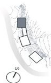
Schéma půdorysu bytu představuje dispoziční řešení bytu. Kuchynská linka a nábytek nejsou součástí dodávky bytu, zařízení je zobrazeno pouze pro názornost. Plocha zahrady je orientační. Specifikace pro konstrukce, povrchové úpravy a rozsah vybavení je předmětem přílohy "Standard nemovitosti".