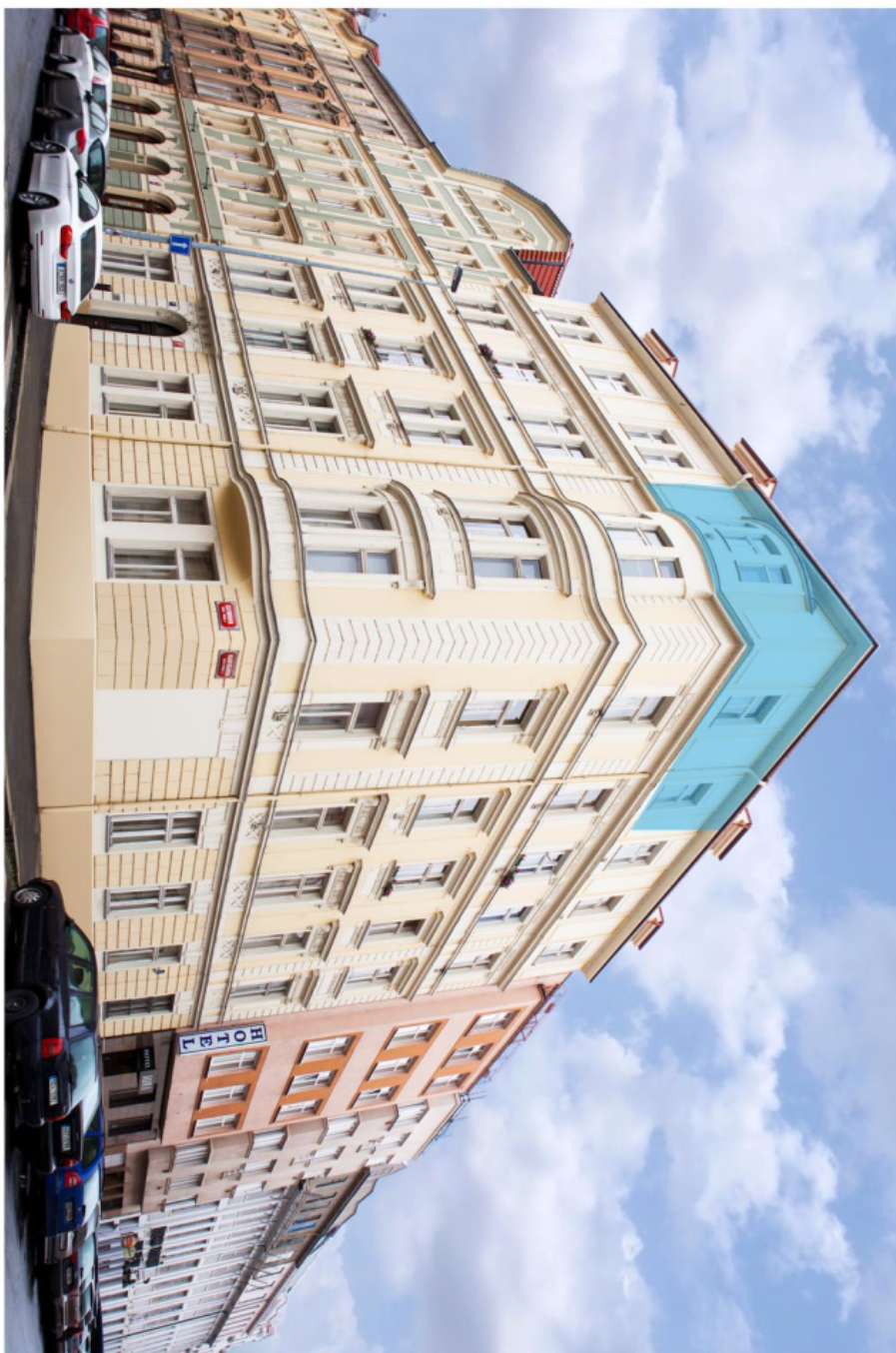
umístění bytu v objektu