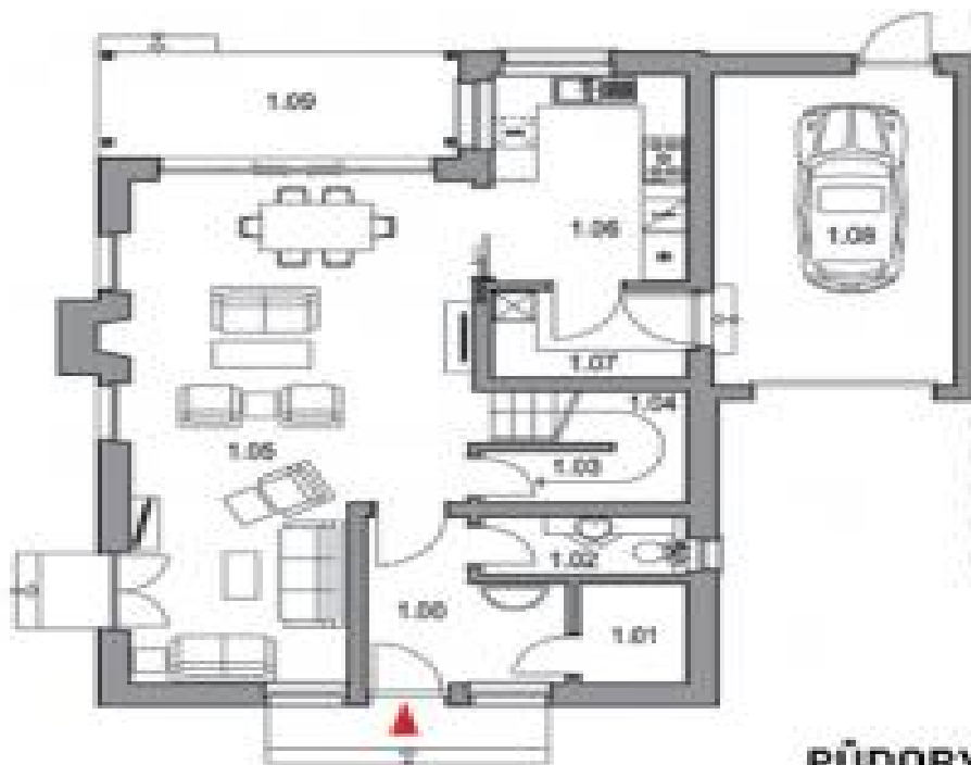
PŮDORYS 1.NP / GROUND FLOOR