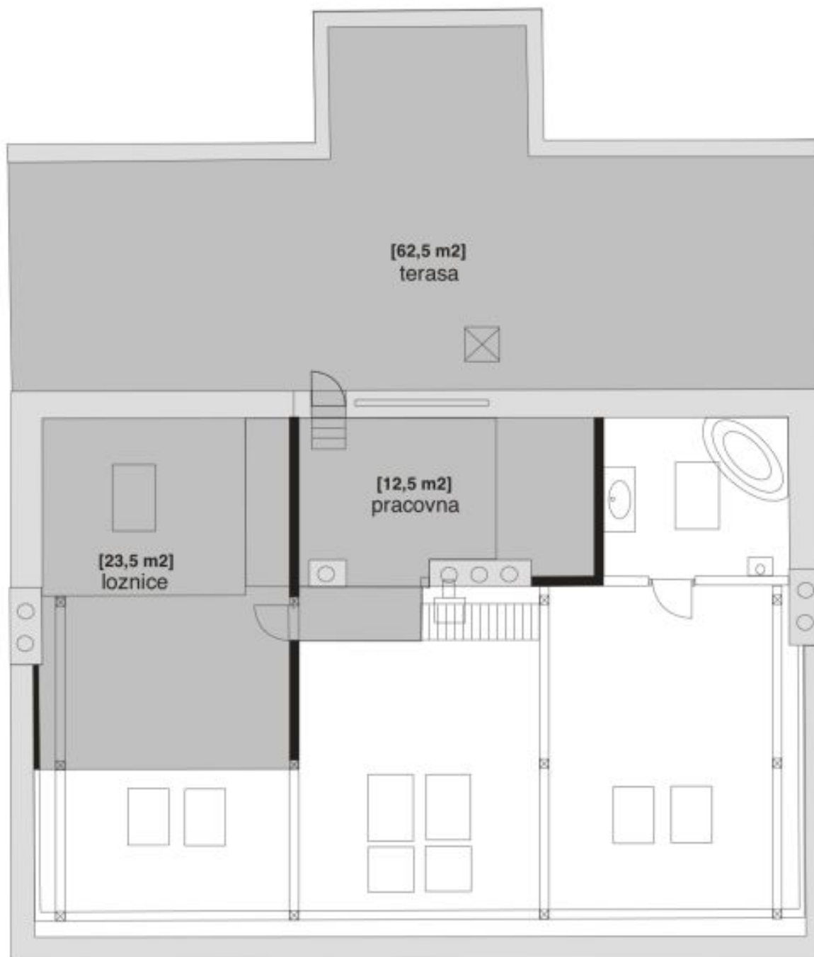
patro s terasou