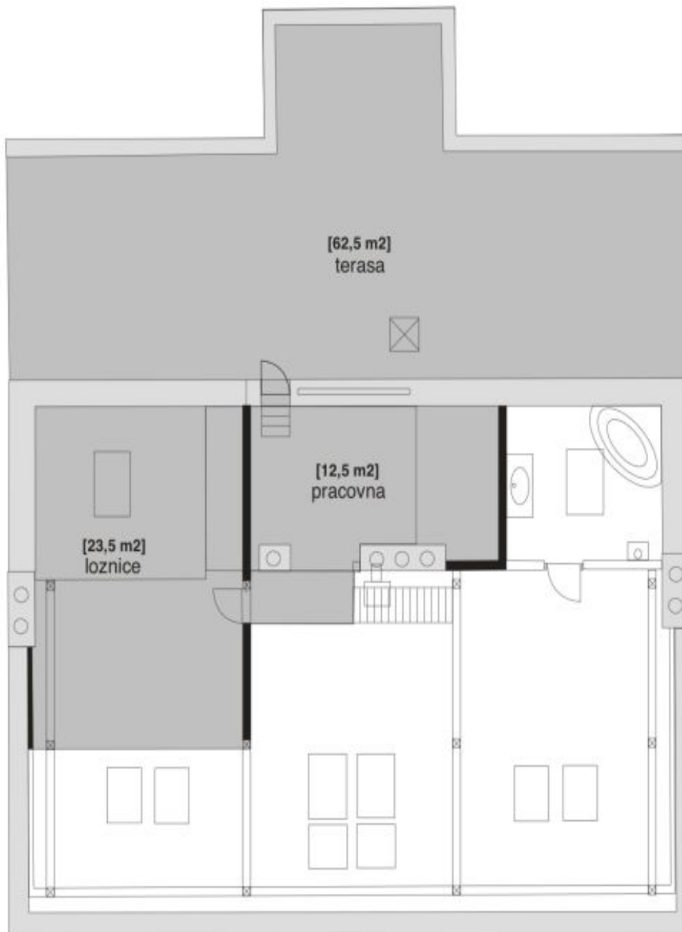
patro s terasou