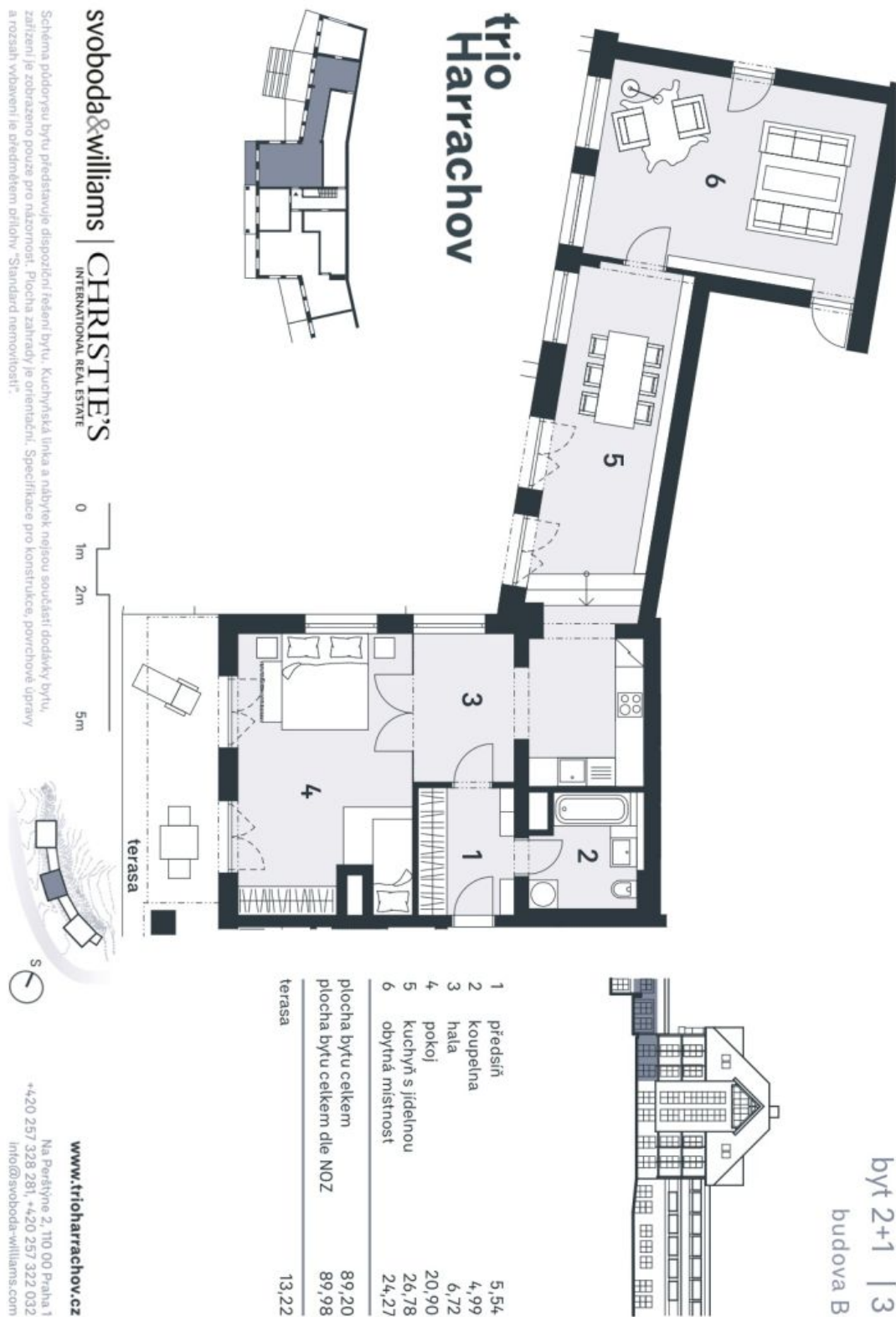
Schéma půdorysu bytu představuje dispozici řádkem bytu. Kuchyňská linka a nábytek nejsou součástí dodávky bytu, zařízení je zobrazeno pouze pro názornost. Plocha zahrady je orientační. Specifikace pro konstrukce, povrchové úpravy a rozsah vřobavení je uvedeném přílohy "Standard nemovitosti".