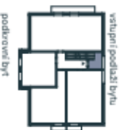
vestupní podlaží bytu