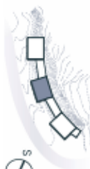
Schéma podlažnosti bytu představuje dispozici řádně řešeného bytu. Kuchyňská linka a nábytek nejsou součástí dodávky bytu, zařízení je zobrazeno pouze pro názornost. Plocha zahrady je orientační. Specifikace pro konstrukci, povrchové úpravy a rozsaňi vzhledem le předněm orřivě "Standard nemovitosti".

svoboda&williams | CHRISTIE'S INTERNATIONAL REAL ESTATE