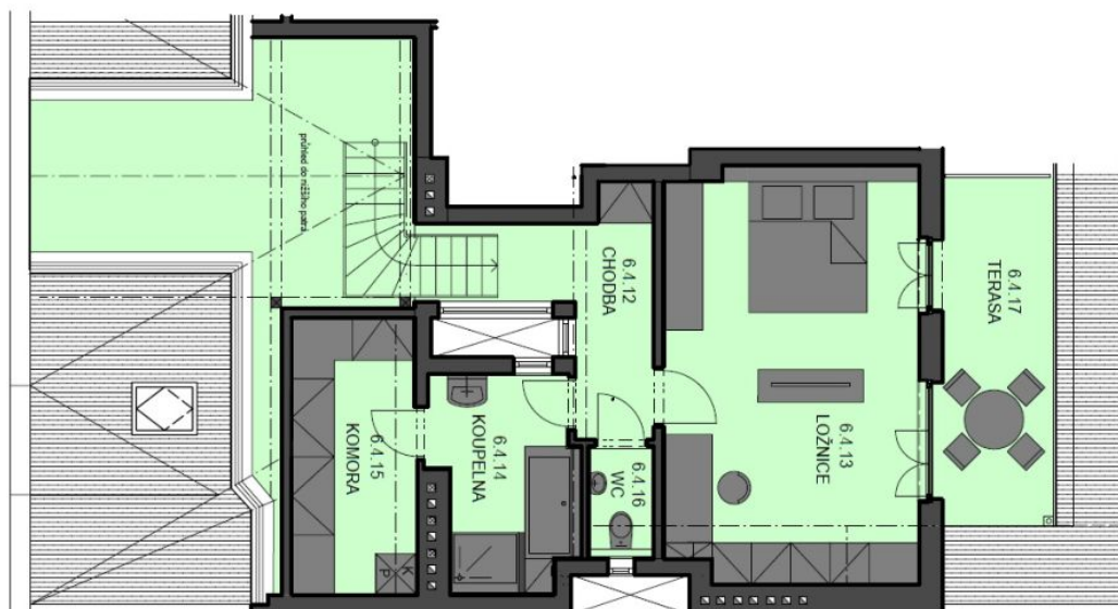
PŮDORYS 7. NP