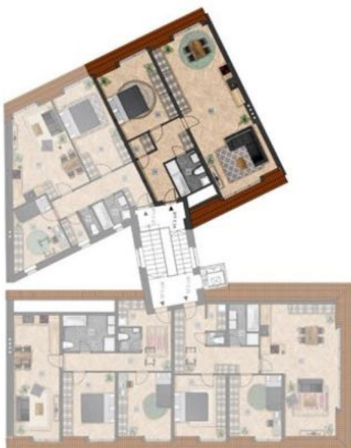
umístění bytu na patře