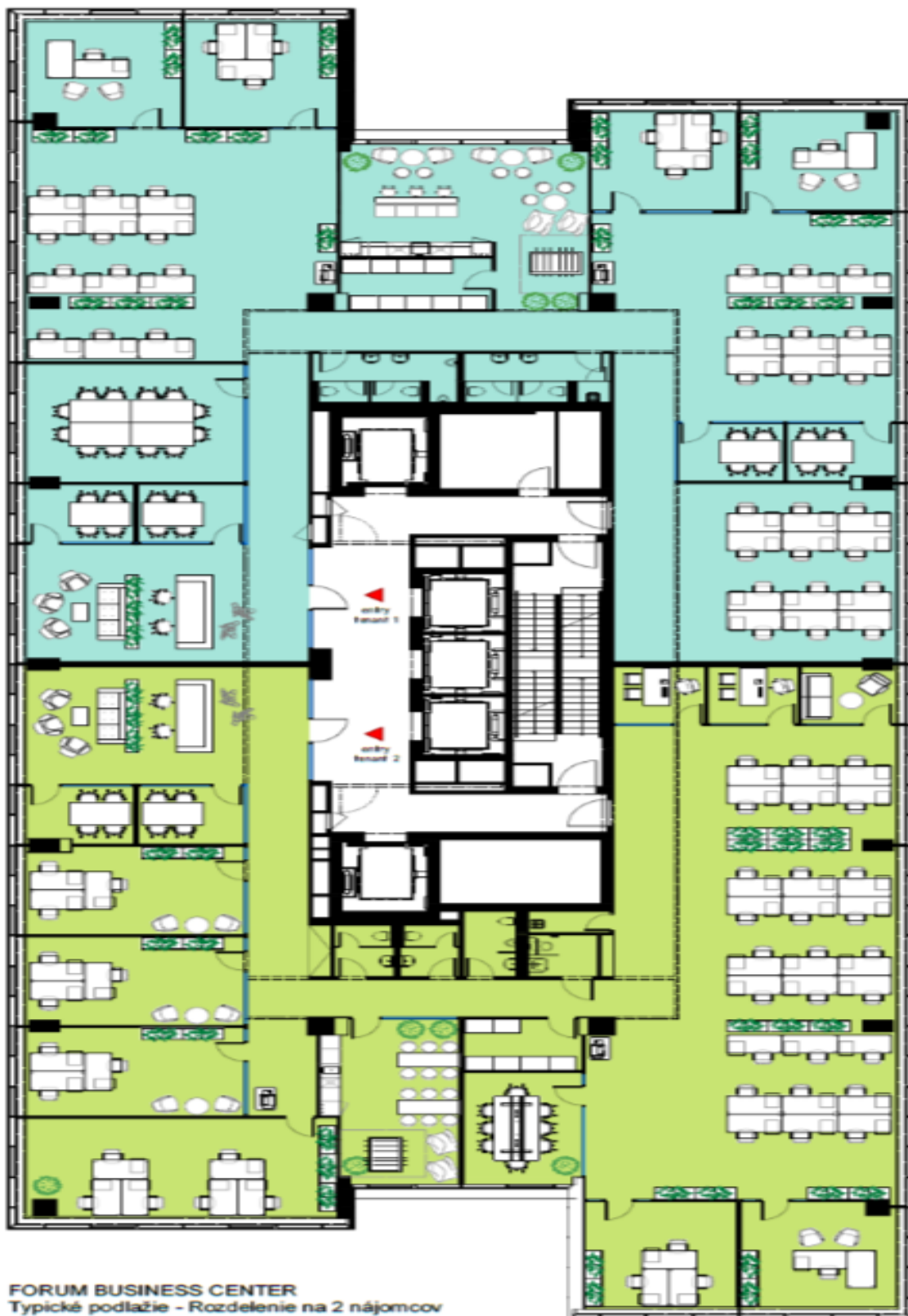
FORUM BUSINESS CENTER Typické podlažie - Rozdelenie na 2 nájomcov