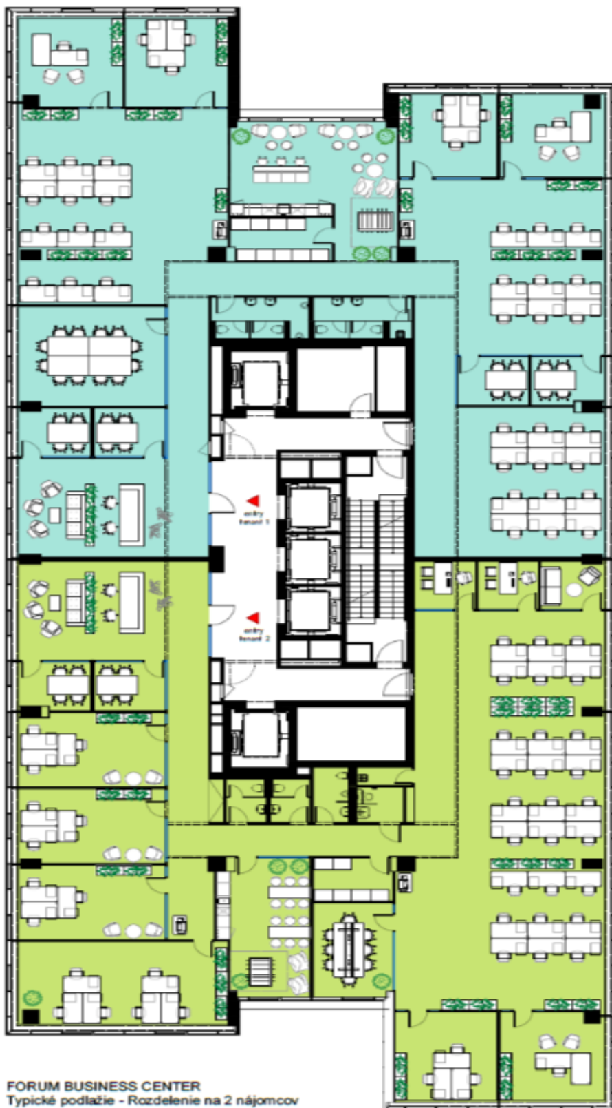
FORUM BUSINESS CENTER Typické podlažie - Rozdelenie na 2 nájomcov