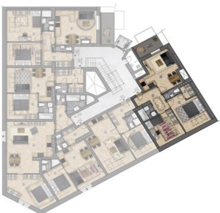
umístění bytu na patře