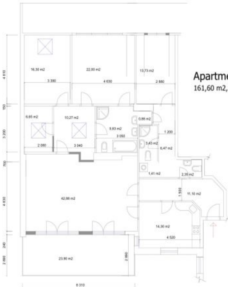
Apartment II, 6th Floor 161,60 m 2 , Balcony + terrace 23,9 m 2