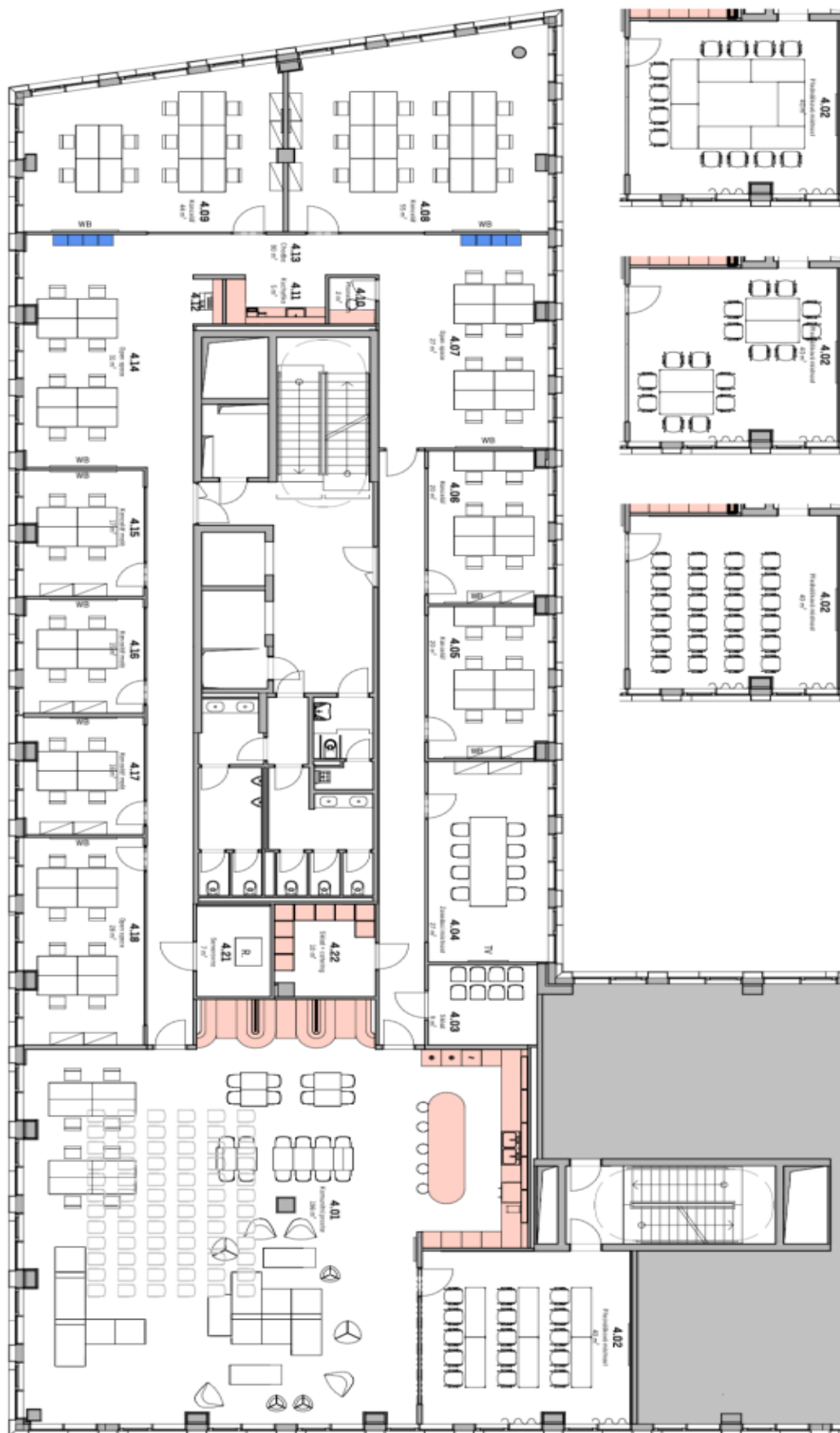
Varianty uspořádání místnosti 4.02