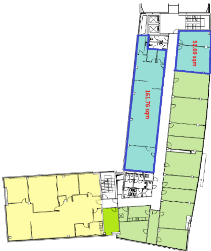
Building A 2 nd above ground floor (AF2) - Total leasable area 215,45 sqm – marked in blue – 1-April-2022