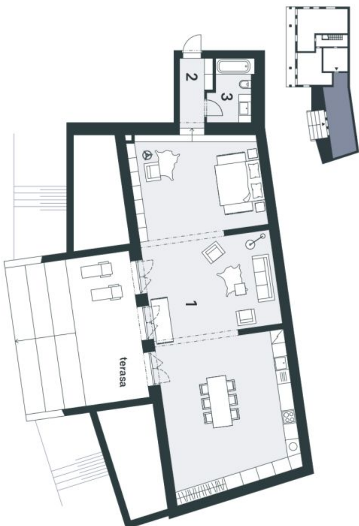
Schéma podkrovy bytu představuje dispoziční řešení bytu. Kuchynská linka a nábytek nejsou součástí dodávky bytu, zařízení je zobrazeno pouze pro názornost. Plocha zahrady je orientační. Specifikace pro konstrukce, povrchové úpravy a rozsah vybavení je předmětem přílohy "Standard nemovitosti".

svoboda&williams | CHRISTIE'S INTERNATIONAL REAL ESTATE