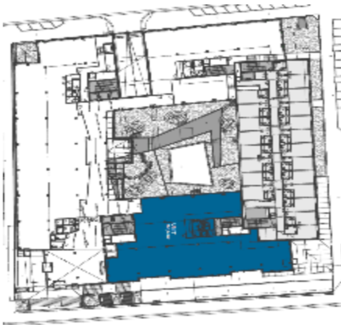
1. patro / 1st floor