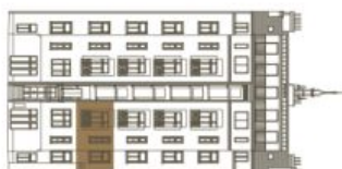
Schéma půdorysu bytu představuje dispozici řešení bytu. Kuchyňská linka a nábytek nejsou součástí dodávky bytu, zařízení je zobrazeno pouze pro názornost. Plocha zahrady je orientační. Specifikace pro konstrukce, povrchové úpravy a rozsah vybavení je předmětem přílohy "Standard nemovitosti".

svoboda&williams | CHRISTIE'S INTERNATIONAL REAL ESTATE