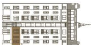
Schéma půdorysu bytu představuje dispozici řešení bytu. Kuchyňská linka a nábytek nejsou součástí dodávky bytu, zařízení je zobrazeno pouze pro názornost. Plocha zahrady je orientační. Specifikace pro konstrukce, povrchové úpravy a rozsah vybavení je předmětem přílohy "Standard nemovitosti".

svoboda&williams | CHRISTIE'S INTERNATIONAL REAL ESTATE