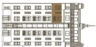
Schéma půdorysu bytu představuje dispozici řešení bytu. Kuchyňská linka a nábytek nejsou součástí dodávky bytu, zařizování je zobrazeno pouze pro názornost. Plocha zahrady je orientační. Specifikace pro konstrukce, povrchové úpravy a rozsah vybavení je předmětem přílohy "Standard nemovitosti".

svoboda&williams | CHRISTIE'S INTERNATIONAL REAL ESTATE