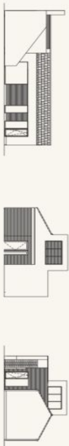
Schéma půdorysu domu představuje dispozici řešené domu. Kuchynská linka a nábytek nejsou součástí dodávky domu, zajištění je zábrázováno pouze pro názornost. Specifikace pro konstrukce, povrchové úpravy a rozložení vybavení je přiložen přílohy "Standard nemovitosti". Dávající si výrazuje právo na změny a upřesnění bez předchozího upozornění!