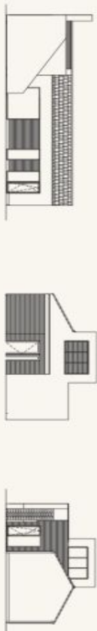
Schéma půdorysu domu představuje dispozici řešené domu. Kuchynská linka a nábytek nejsou součástí dodávky domu, zobrazení je zobrazeno pouze pro názornost. Specifikace pro konstrukce, povrchové úpravy a rozsoch výtvarení je předmětem přílohy "Standard nemovitosti". Dávající si výrazuje právo na změny a upřesnění bez předchozího upozornění!