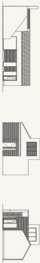
Schéma půdorysu domu představuje dispozici řešení domu. Kuchynská linka a nábytek nejsou součástí dodávky domu, zřízení je zahrnuto pouze pro názornost. Specifikace pro konstrukce, povrchové úpravy a rozsoch výtvarení je předmětem přílohy "Standard nemovitosti". Dávající si výrazuje právo na změny a upřesnění bez předchozího upozornění!