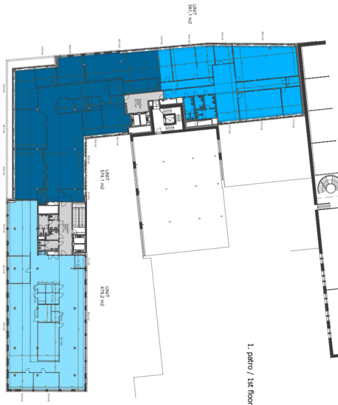
1. patro / 1st floor