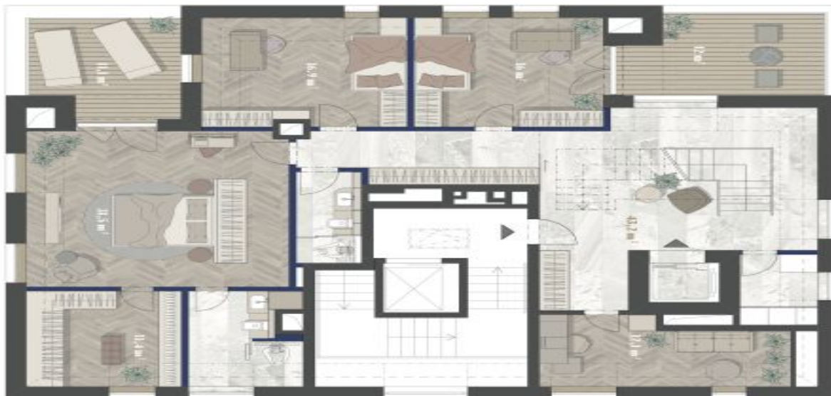
2.NP 2ND FLOOR