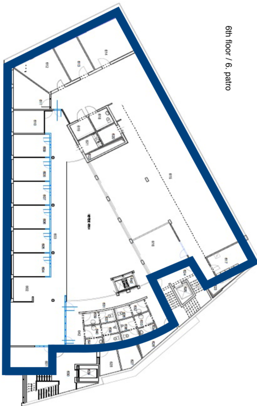
6th floor / 6. patro