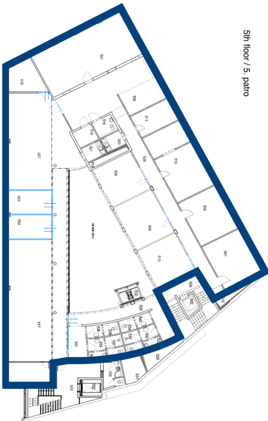
5th floor / 5. patro