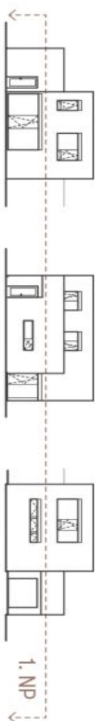
Schéma podlahy domu představuje dispozici reálné domy. Kuchyňská linka a nábytek nejsou součástí dodávky domu, zobrazení je zobrazeno pouze pro názornost. Specifické pro konstrukci, povrchové úpravy a rozložení vlnění je představen přílohy "Standard memorizací". Developer si vyhrazuje právo na změny a upřesnění bez předchozího upozornění.