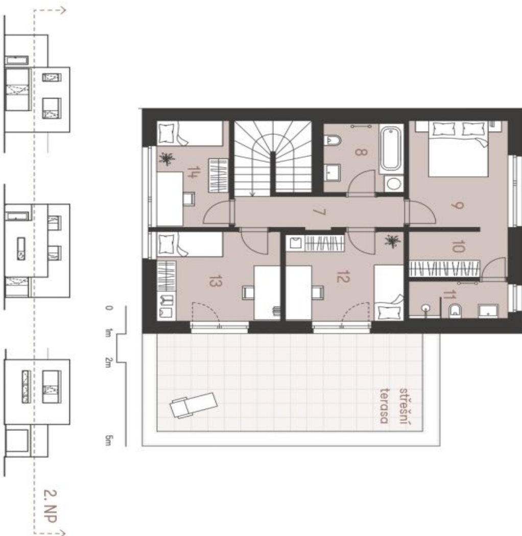
Schéma podlahy je pouze orientační. Pro bližší informace o dispozici a vybavení domu, kontaktujte přímo současně dodávatele domu, zveřejněn je zobrazeno pouze pro názornost. Specifické podmínky, povinnosti a podmínky vztahující se k této nabídce je možné najít v "Standardní smlouvě o prodeji nemovitosti". Developer si vyhrazuje právo na změny a upřesnění bez předchozího upozornění.