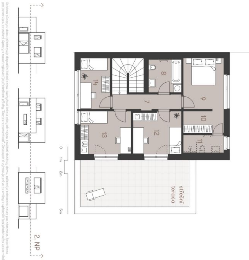
Schéma podlahy domu představuje alternativní řešení domu. Kuchynská linka a nábytek nejsou součástí dodávky domu, zřízení je zobrazeno pouze pro názornost. Specifická pro konstrukci, povrchové úpravy a rozsah výhledů je předním přídělí. Standard nemovitosti: „Developer si vyhrazuje právo na změny a upřesnění bez předchozího upozornění.“