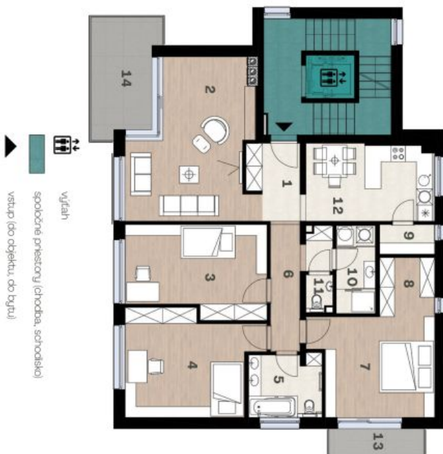
Schéma pôdorysu domu predstavuje dispozíciu rezidenčnej budovy. Developer si vyhradzuje právo na zmenu a upresnenie bez predvýstrahy a upozornenia.