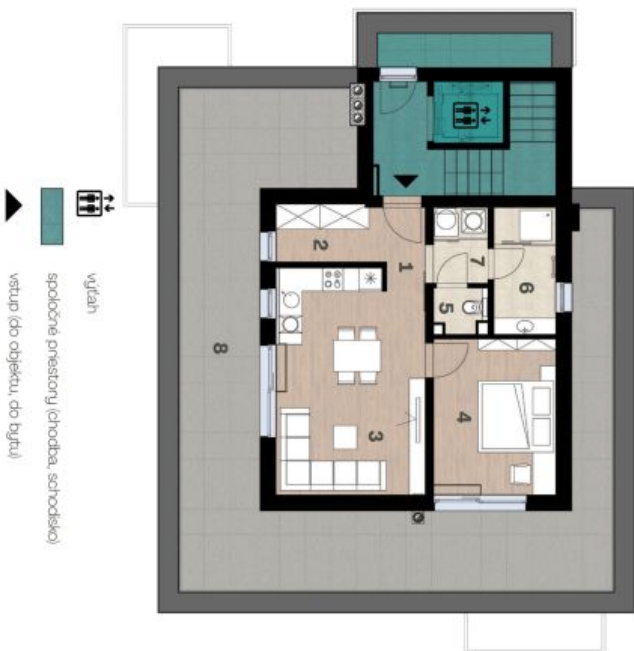
Schéma pôdorysu domu predstavuje dispozíciu interieru bytu. Developer si vyhradzuje právo na zmenu a upresnenie bez predchádzajúceho upozornenia.