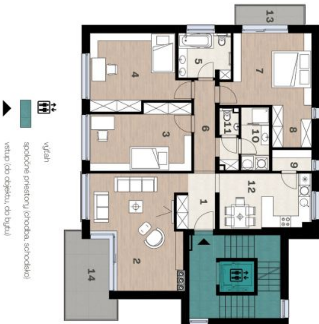
Schéma pôdorysu domu predstavuje dispozíciu miestností bytu. Developer si vyhradzuje právo na zmeny a úpravy bez predbežnej dohody a upozornenia.