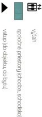
Schéma pôdorysu domu predstavuje dispozíciu rešerché bytu. Developer si vyhradzuje právo na zmenu a upresnenie bez predchádzajúceho upozornenia.