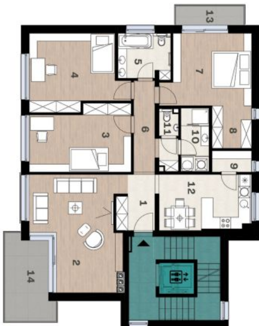
Schéma pôdorysu domu predstavuje dispozíciu niektorých dostupných priestorov bytu. Developer si vyhradzuje právo na zmeny a úpravy bez predvýstrahy a upozornenia.