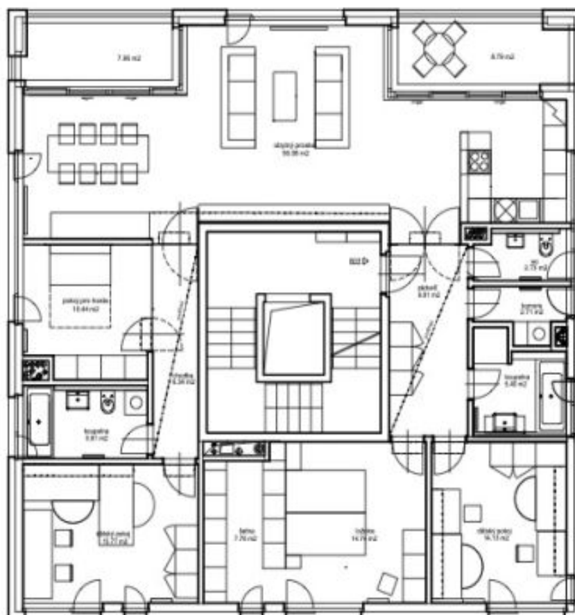
schéma bytu B21+B22 - 2np

151 m 2 , Praha 4, Podolí, Na Hřebenech I