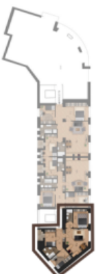
PODLAŽÍ / FLOOR