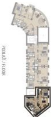
PODLAŽÍ / FLOOR