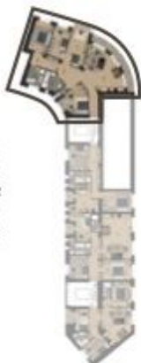
PODLAŽÍ / FLOOR