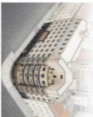
PODLAŽ / FLOOR