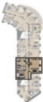
VÝMĚRA BYTU / FLAT AREA