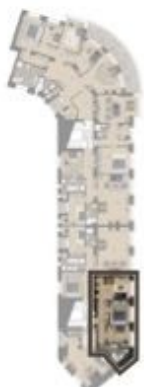
VÝMĚRA BYTU / FLAT AREA