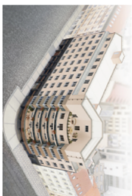
PODLAŽÍ / FLOOR