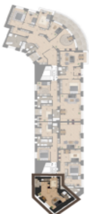
VÝMĚRA BYTU / FLAT AREA