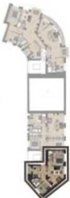
PÓDLAŽÍ / FLOOR