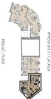
PÓDLAŽÍ / FLOOR