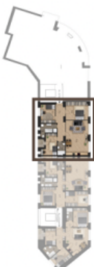
PODLAŽÍ / FLOOR