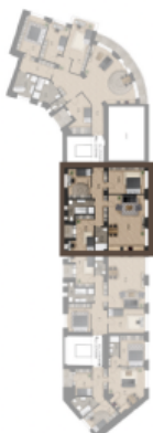
PODLAŽÍ / FLOOR