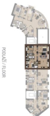
PODLAŽÍ / FLOOR