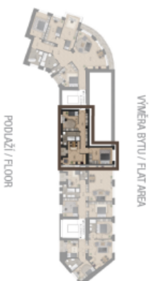
VMĚRA BYTU / FLAT AREA