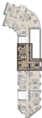
PODLAŽÍ / FLOOR