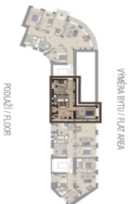
PODLAŽÍ / FLOOR