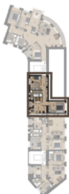
PODLAŽÍ / FLOOR