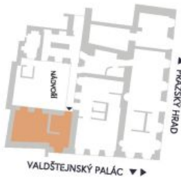
UMÍSTĚNÍ V RÁMCI PODLAŽÍ