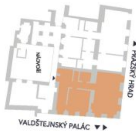
UMÍSTĚNÍ V RÁMCI PODLAŽÍ