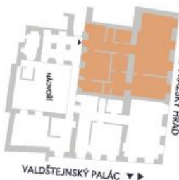
UMÍSTĚNÍ V RÁMCI PATRA