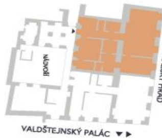
UMÍSTĚNÍ V RÁMCI PATRA