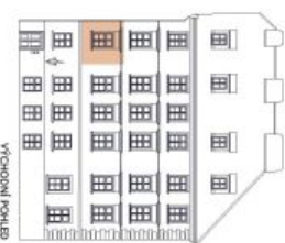
UMÍSTĚNÍ V RÁMCI PODLAŽÍ