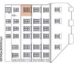
UMÍSTĚNÍ V RÁMCI PODLAŽÍ