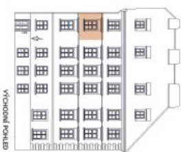
UMÍSTĚNÍ V RÁMCI PODLAŽÍ