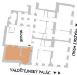
UMÍSTĚNÍ V RÁMCI PATRA